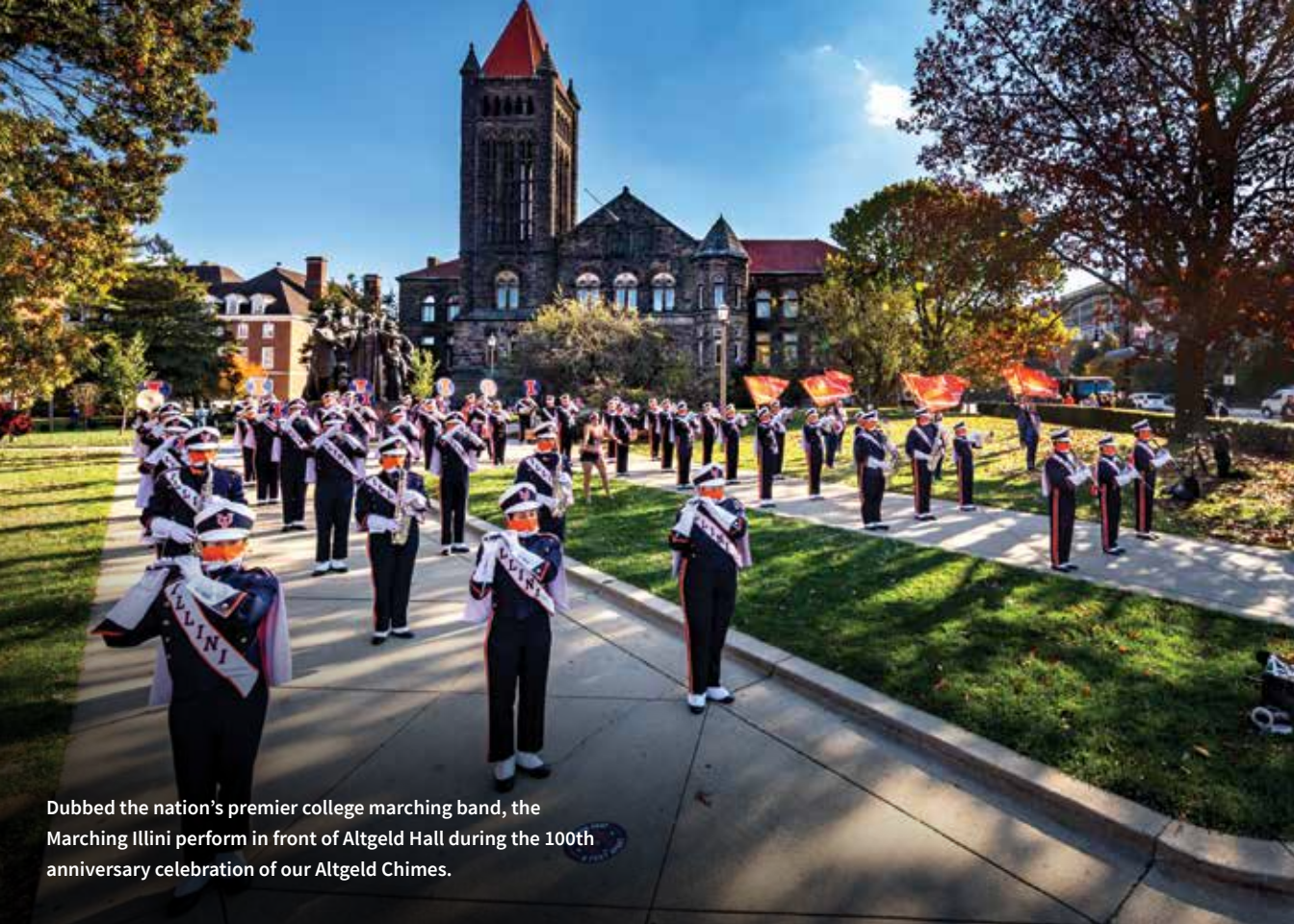
Dubbed the nation's premier college marching band, the Marching Illini perform in front of Altgeld Hall during the 100th anniversary celebration of our Altgeld Chimes.