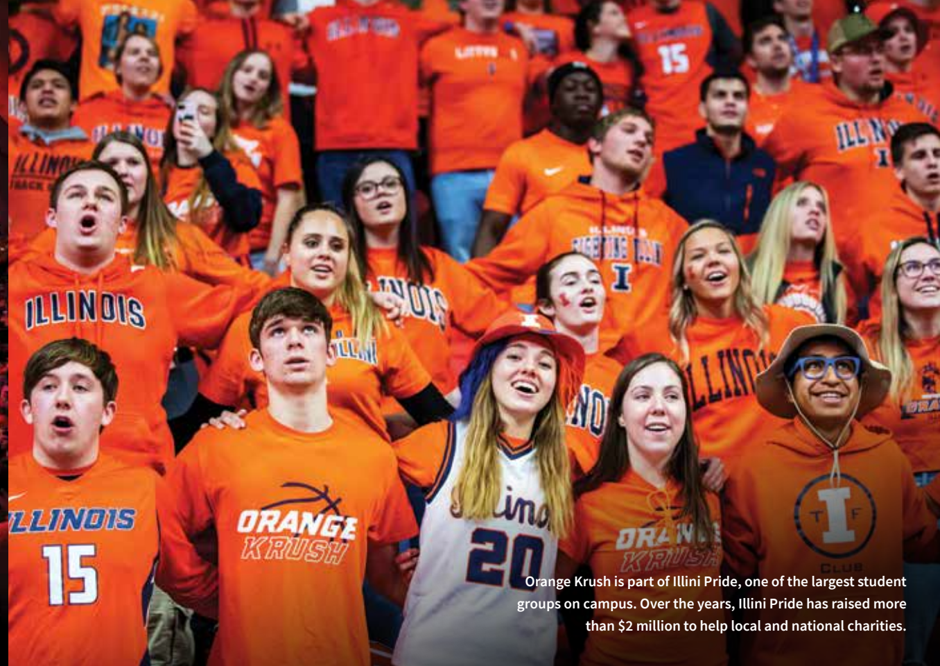
Orange Krush is part of Illini Pride, one of the largest student groups on campus. Over the years, Illini Pride has raised more than $2 million to help local and national charities.