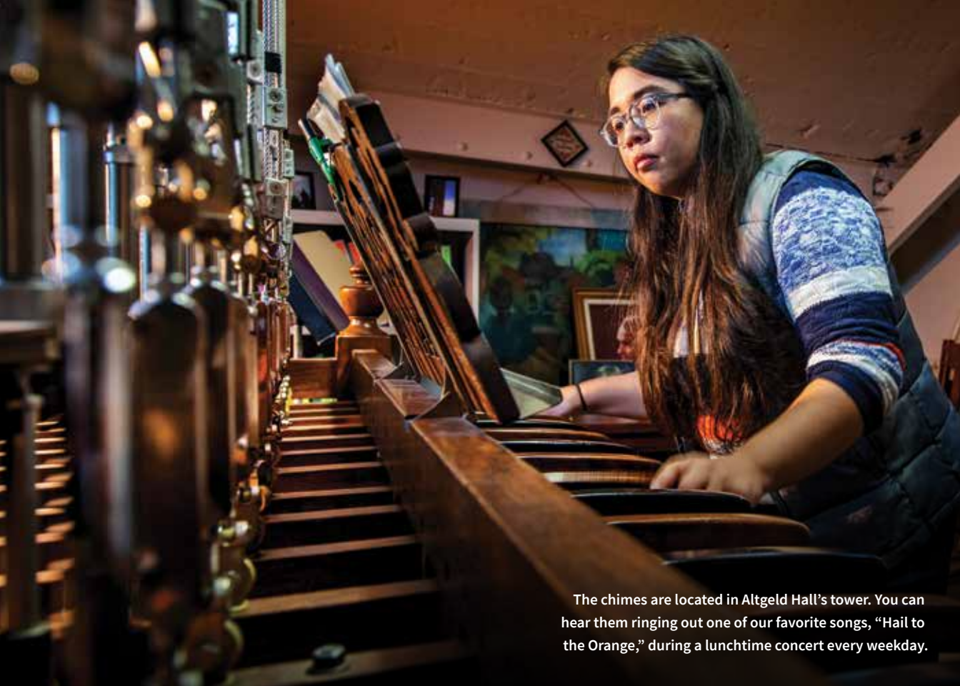
The chimes are located in Altgeld Hall's tower. You can hear them ringing out one of our favorite songs, "Hail to the Orange," during a lunchtime concert every weekday.