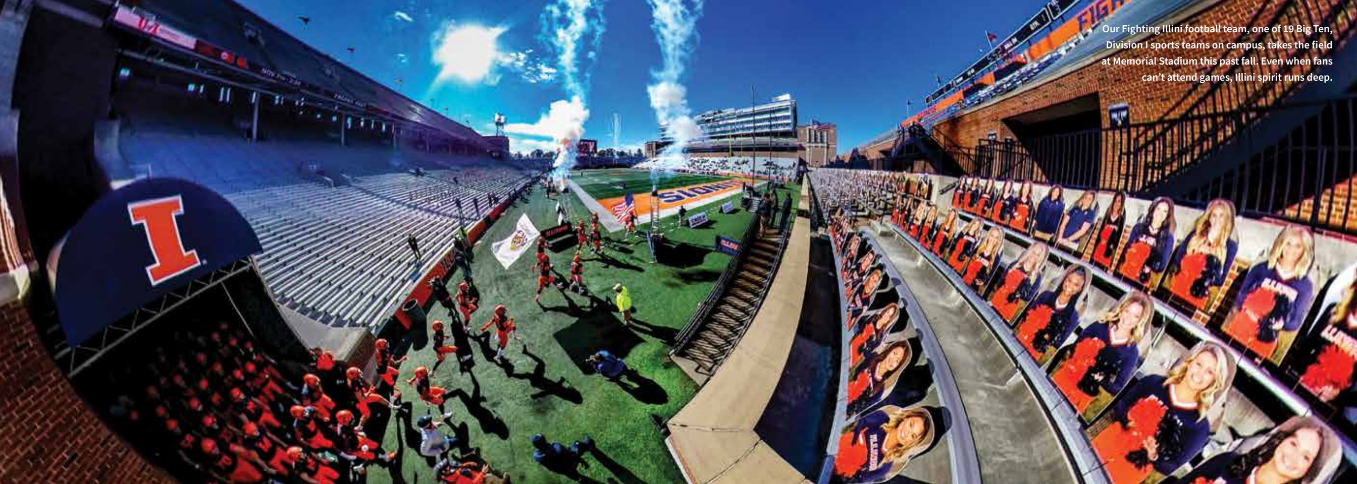
Our Fighting Illini football team, one of 19 Big Ten, Division I sports teams on campus, takes the field at Memorial Stadium this past fall. Even when fans can't attend games, Illini spirit runs deep.