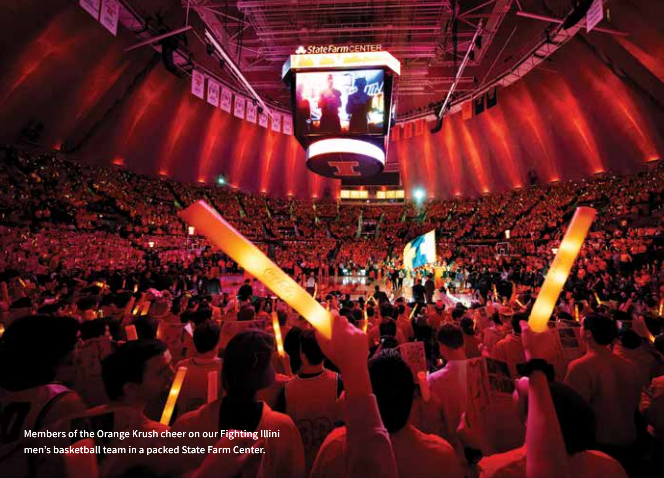
Members of the Orange Krush cheer on our Fighting Illini men's basketball team in a packed State Farm Center.